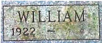
Added by RWCNAC